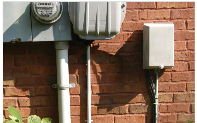
ONT closed with FTTP drop cable inside