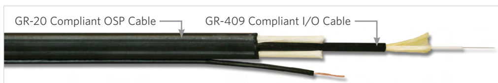
Superior Essex FTTP Tight Buffered Indoor/Outdoor Drop (Series W7)