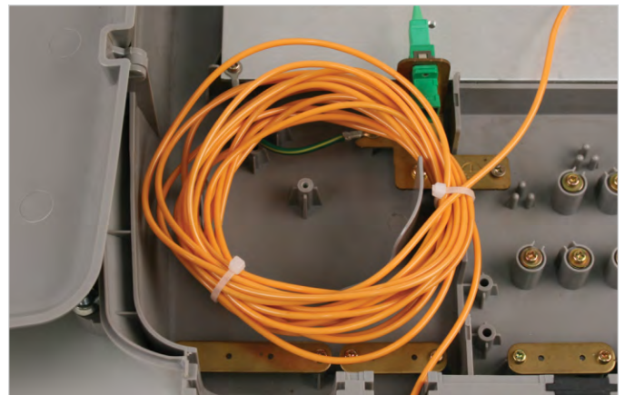
ONT open with drop cable secured and several feet of buffer tube coiled inside

FTTP tight buffer drop cable is an indoor/outdoor cable rated at -40^{\circ}\text{C} to +65^{\circ}\text{C} . It is available with or without a toneable element. It is available with a MDPE jacket or an OFNR-rated PVC jacket. The cable meets GR-20, PE-90 and is listed on the RUS/RDUP website.