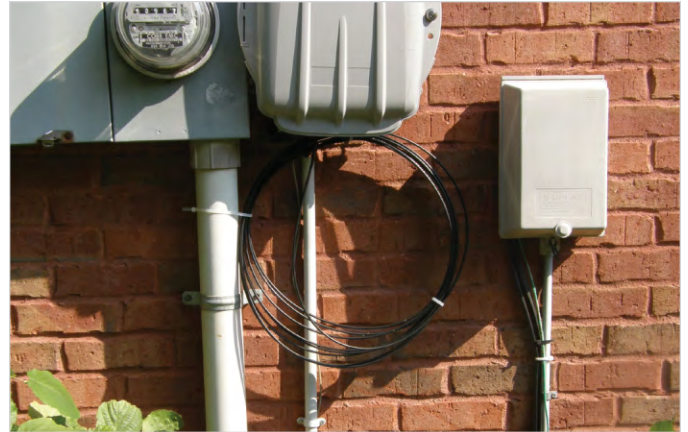
ONT closed with FTTP drop cable loop adjacent

The simplex tight buffer inner cable utilizes bend insensitive single mode fiber and can be tightly coiled without attenuation loss. This functionality allows all excess fiber to be neatly and safely stored within the smallest of conventional ONT enclosures.